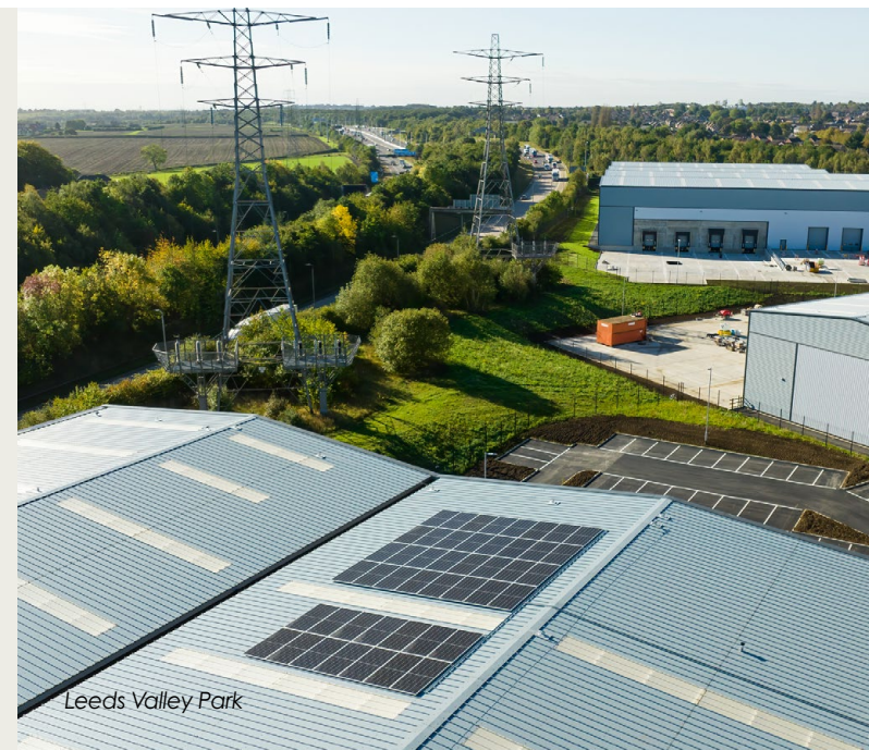
Leeds Valley Park