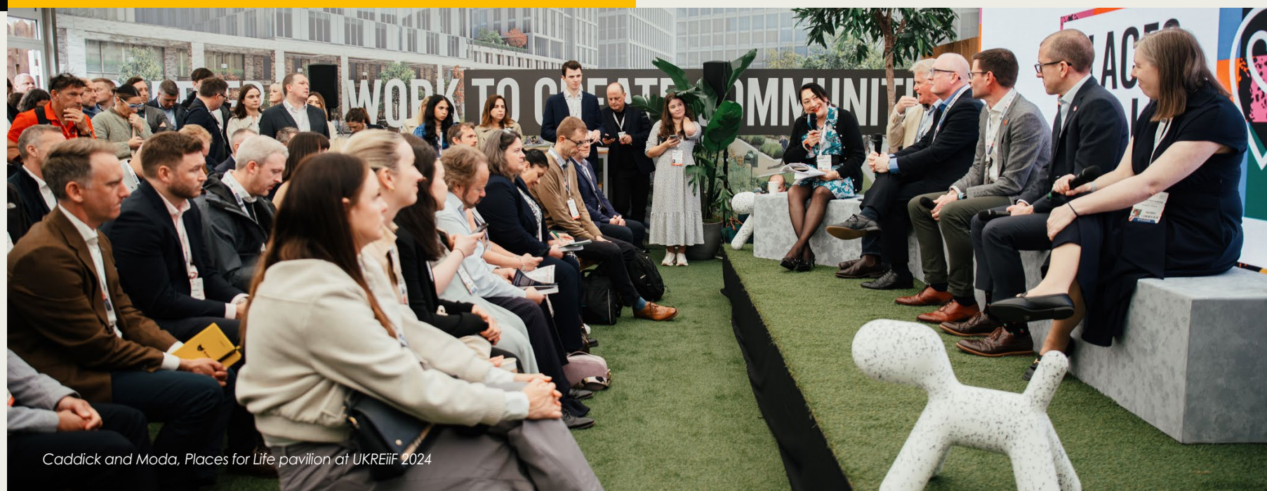
Caddick and Moda, Places for Life pavilion at UKREIF 2024

As we move forwards, we remain committed to working collaboratively across our businesses, partners, and communities to deliver lasting positive impact—ensuring that we continue to lead in creating the best places for people and the planet.