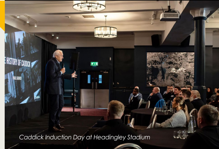
Caddick Induction Day at Headingley Stadium

Last year, we supported 14 T – Level students in both office and site locations, with our commitment to empowering employees through apprenticeships and student placements recognised audit scheme, where we were granted Gold accredited membership.