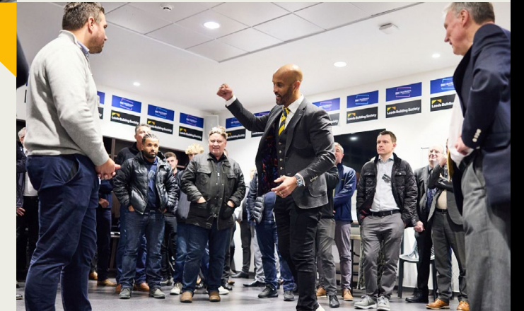
Jamie Jones Buchanan Leads Caddick Employees on Headingley Tour.

Helping to foster collaboration, develop understanding and build team spirit, the sessions kick off at the Caddick owned facility at Headingley Stadium in Leeds and run throughout the year.