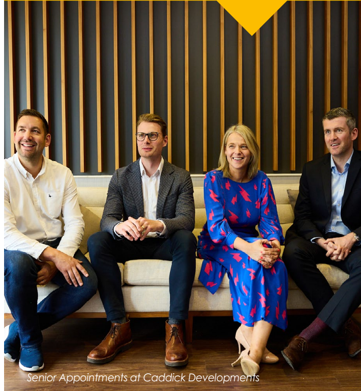
Senior Appointments at Caddick Developments