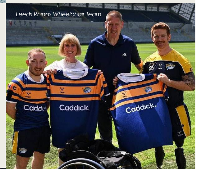
Leeds Rhinos Wheelchair Team

Over the past year, we have worked across our business and with external consultants to develop our pathway to achieving net zero carbon, due to launch in 2025, and have identified climate risks and opportunities aligned with IFRS and TCFD. Our ESG governance is now embedded, ensuring consistent progress and accountability across all parts of the Group.