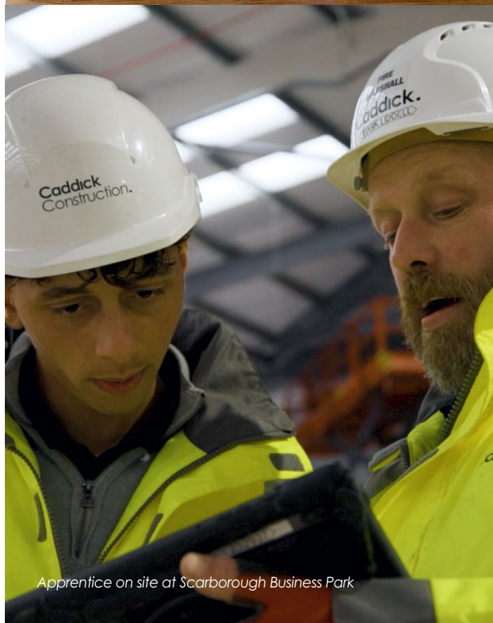
Apprentice on site at Scarborough Business Park